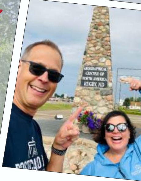
an amazing stop in Rugby 😊

the stone cairn that marks the Geographical Center of North America. It is 21 ft high and 6ft wide and set on a heart shaped foundation. The location was established in January 1931 by a U.S. Geological Survey. The cairn was completed in August 1932 by W.B Paterson and E.B. Paterson with assistance from the local Boy Scouts and other community volunteers. The local Lions Club donated the construction materials and a landmark was born. It remained in that location until July 1971 when Highway 2 was changed to a four lane and it's location was becoming a frontage road. At that time it moved to it's present location of the SE corner intersection of Hwy 2 and 3. In 1994 3 flag poles were added to represent the United States, Canada and Mexico (the countries making up North America).