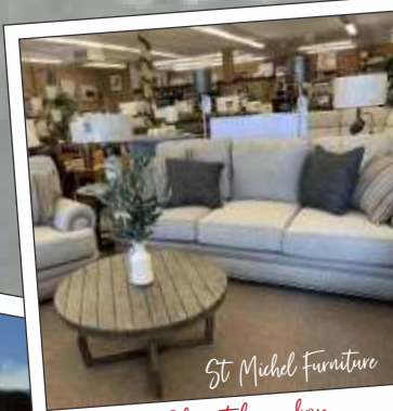
St Michel Furniture Shop til ya drop

Don't miss all the unique stores showcasing a shopping experience you will not forget!