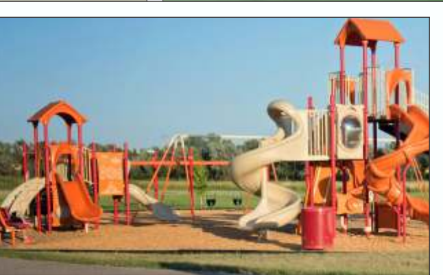
Splash pad coming Summer of 2024