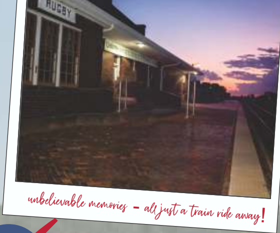
unbelievable memories - all just a train ride away!