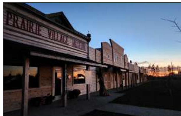
learning about the old days...while makin' new friends!