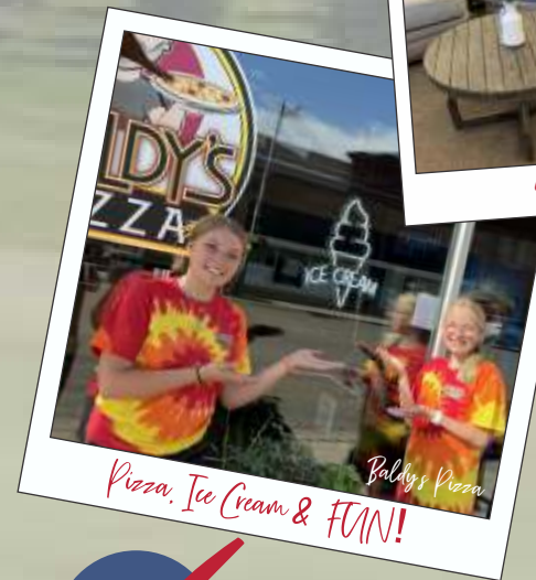
Pizza, Ice Cream & FUN! Baldy's Pizza

Stop in and check out the Rugby's newest take-out Pizza shop. You can't forget to grab an ice cream cone for the road!