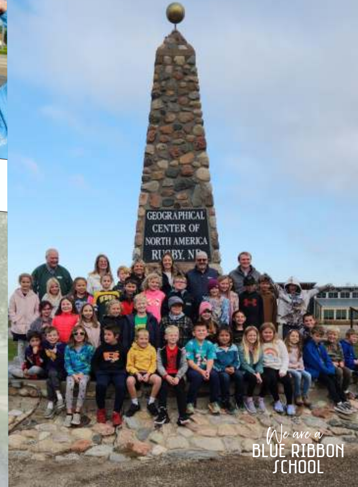
We are a BLUE RIBBON SCHOOL