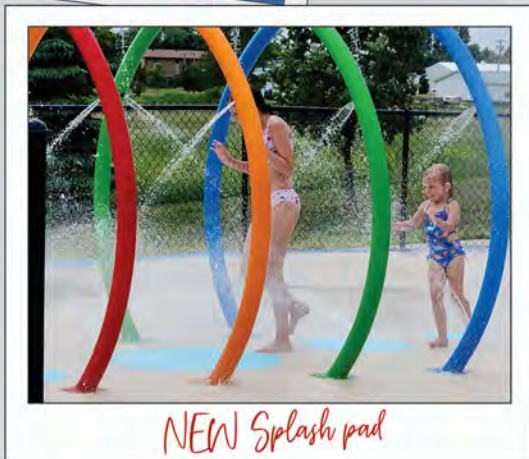
NEW Splash pad