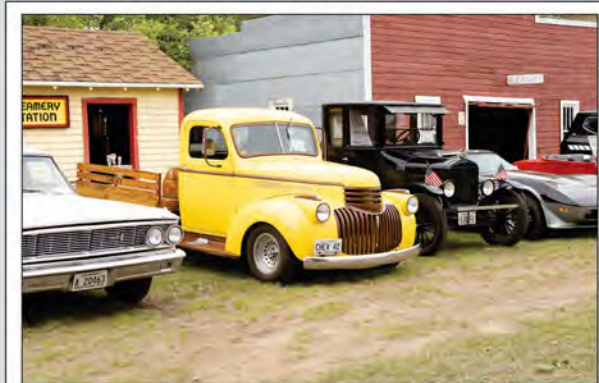
Fun summer days!