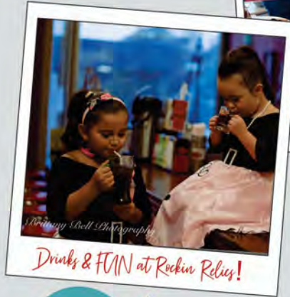
Drinks & FUN at Rockin Relics!